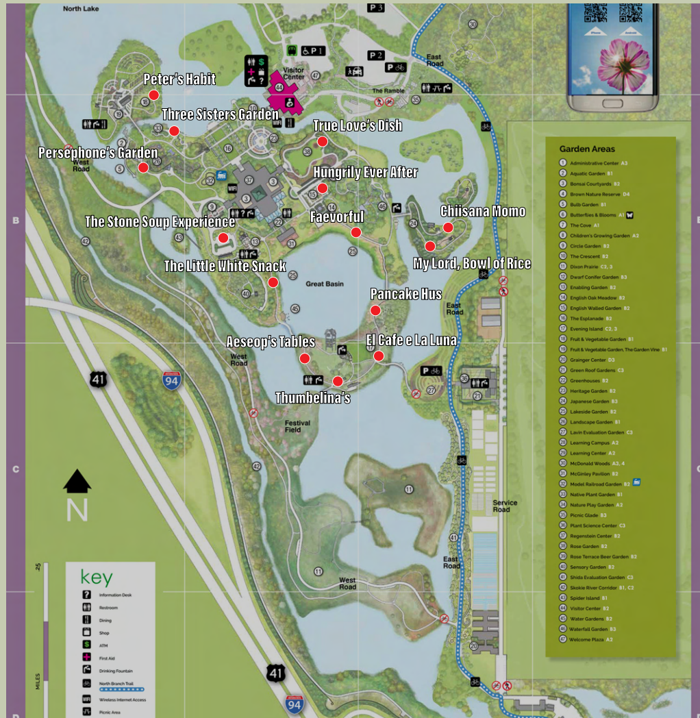
Example layout based on Chicago Botanic Gardens